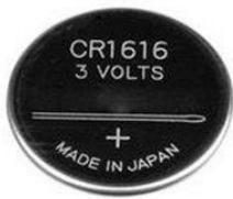
CR1616 Positive Side